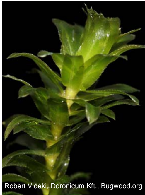
Close up of Hydrilla stem